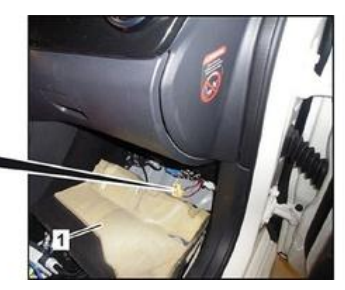
Fold back the footwell trim (1) / Sever the line at the marked point (2) \,