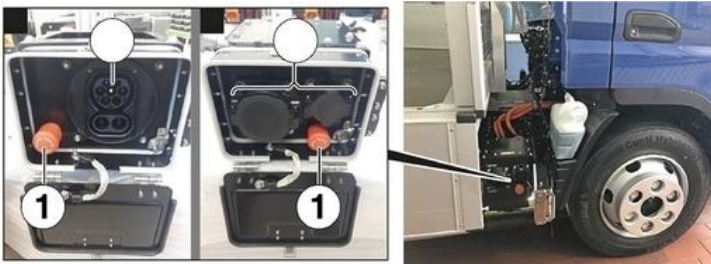
1 EMERGENCY OFF button

The EMERGENCY OFF button is located at the front right behind the front axle fender.